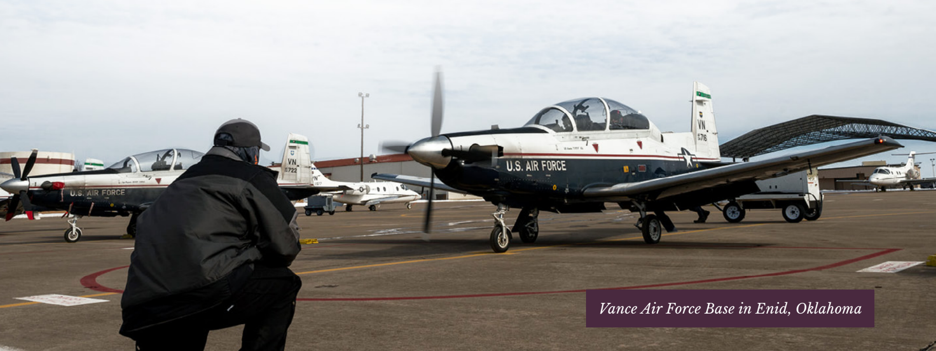
Vance Air Force Base in Enid, Oklahoma

Armstrong Flight Research Center is located in Edwards, California, in the western Mojave Desert.